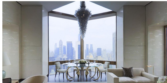
Four Seasons Ty Warner Penthouse New York City, NY