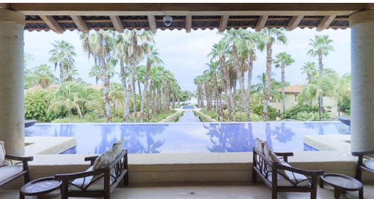
Lobby of the St. Regis Resort Punta Mita, Mexico